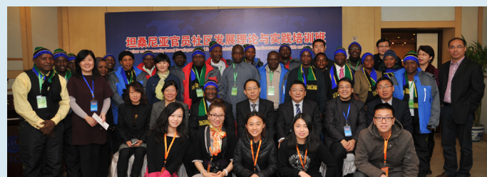
Group photo 开幕式后，参会领导、中国农业大学专家及志愿者与坦桑学员合影